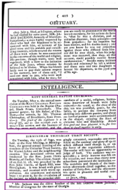
(a) Items less than one page span spread left to right over two columns.

Each number of the Monthly Repository has a number of departments which are most often consisted of a series of items in letter or essay form. When an item takes up less than a page they are sometimes printed over two columns left to right as in (a.) below. However this is not always the case in other places columns are used in a more standard way as in (b) below.