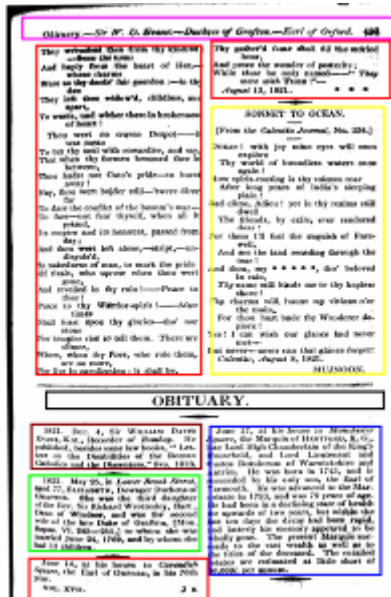
(b) Items of less than one page distributed in a more conventional manner across the columns.