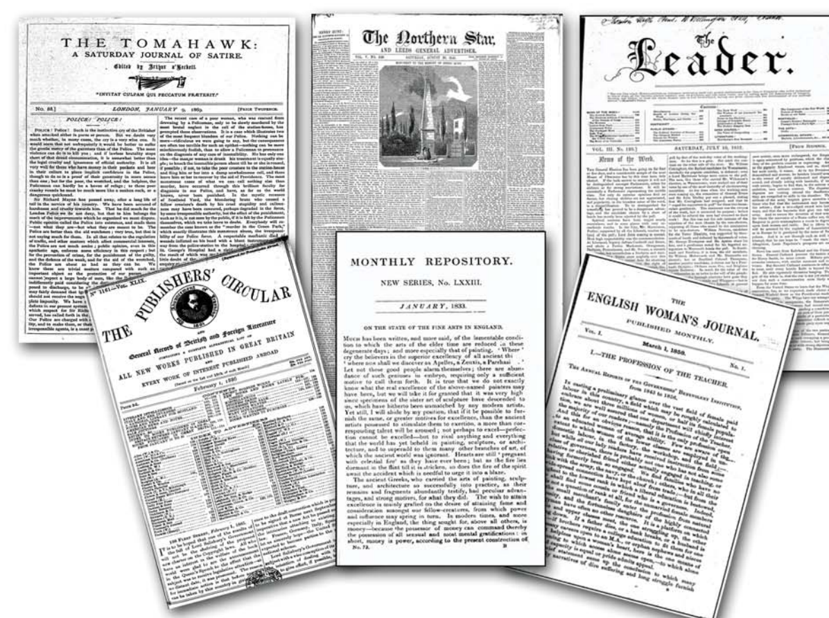
The Tomahawk (1867-1870), The Northern Star (1837-1852) The Leader (1850-1860), The Publishers' Circular (1880-1890) Monthly Repository (1806-1838), English Woman's Journal (1858-1864)